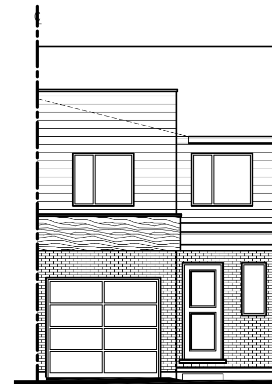
FRONT ELEVATION INTERIOR UNIT 3557 COLONEL TALBOT RD. (DEC. 1/22)