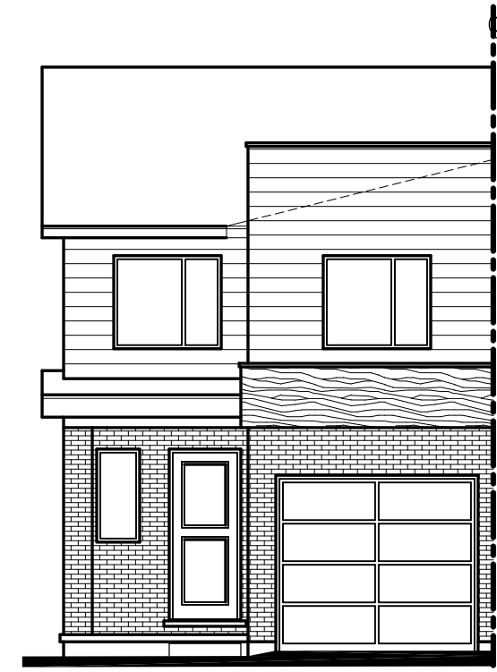
FRONT ELEVATION CORNER UNIT 3557 COLONEL TALBOT RD. (DEC. 1/22)