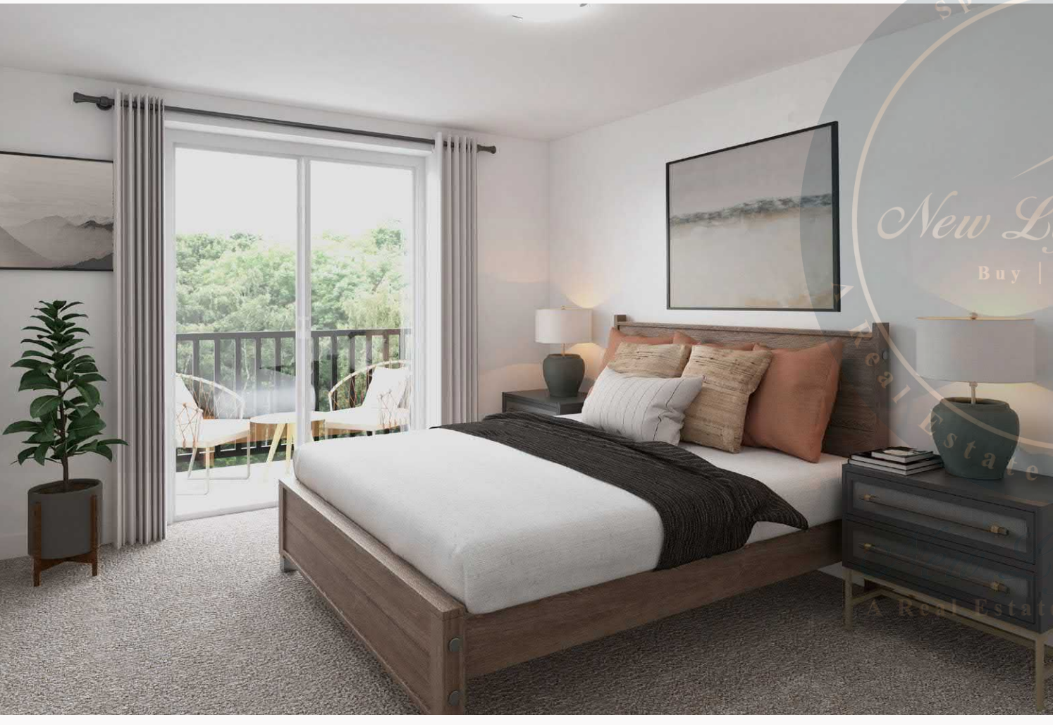
All renderings are an artist's concept and may vary from the final product. Renderings include lighting, furniture and decor that is not included. E. & O.E.

Relax and unwind in your peaceful primary suite. Enjoy the warmth of natural light from your balcony or extra large windows. Retreat to your calming ensuite, complete with LVP flooring, custom built vanity and walk-in shower with sliding glass door.